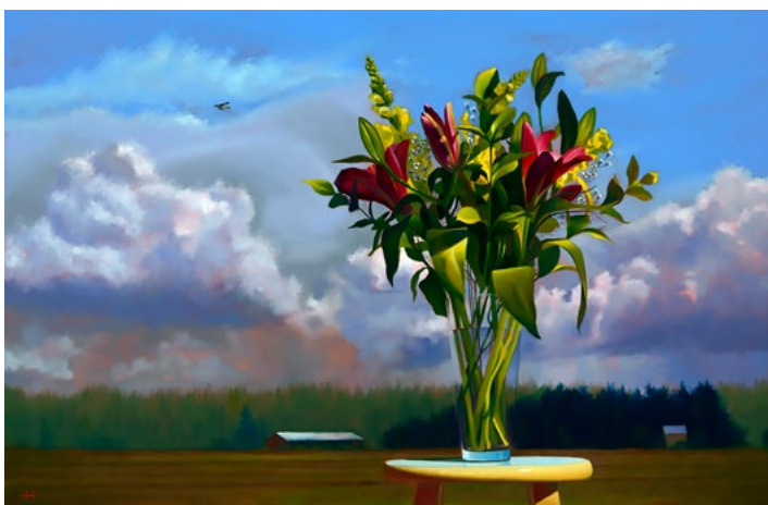
Outstanding in the Field, 36 x 24