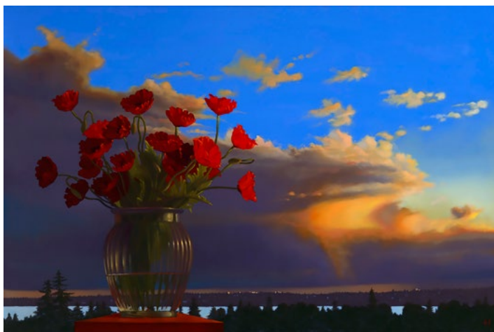
Element of Chance, 36 x 24