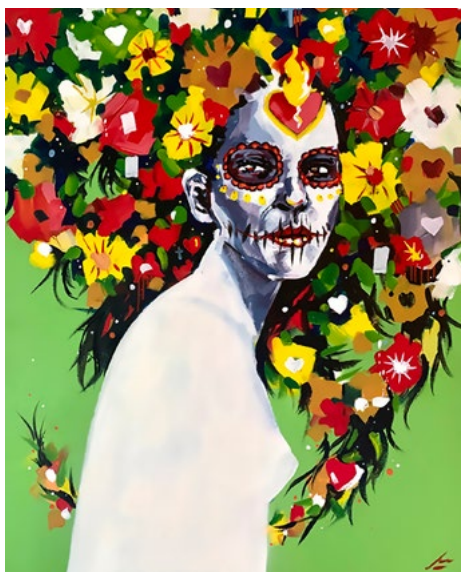
Mujerdela – Primavera