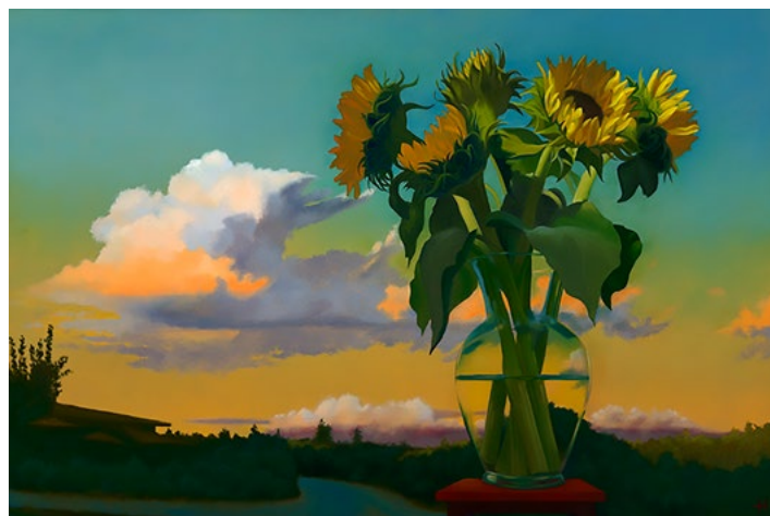
Golden Hour, 36 x 24