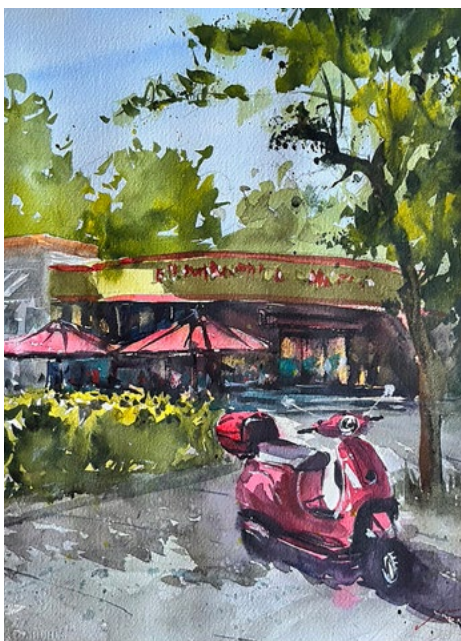
Elephant Deli – Red Vespa