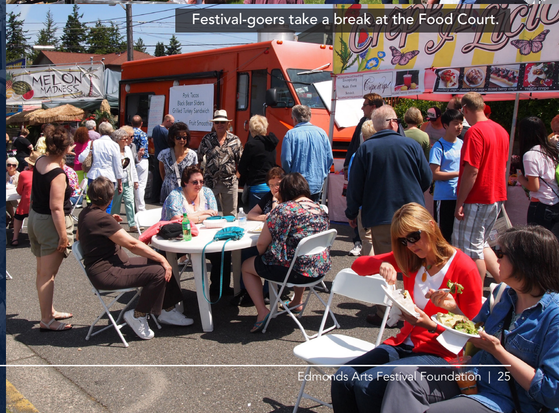
Festival-goers take a break at the Food Court.