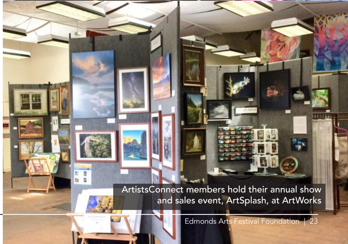
ArtistsConnect members hold their annual show and sales event, ArtSplash, at ArtWorks