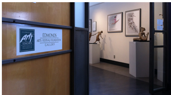
The Arts Festival Gallery in the Anderson Center is presented to the community by the Edmonds Arts Festival Foundation.