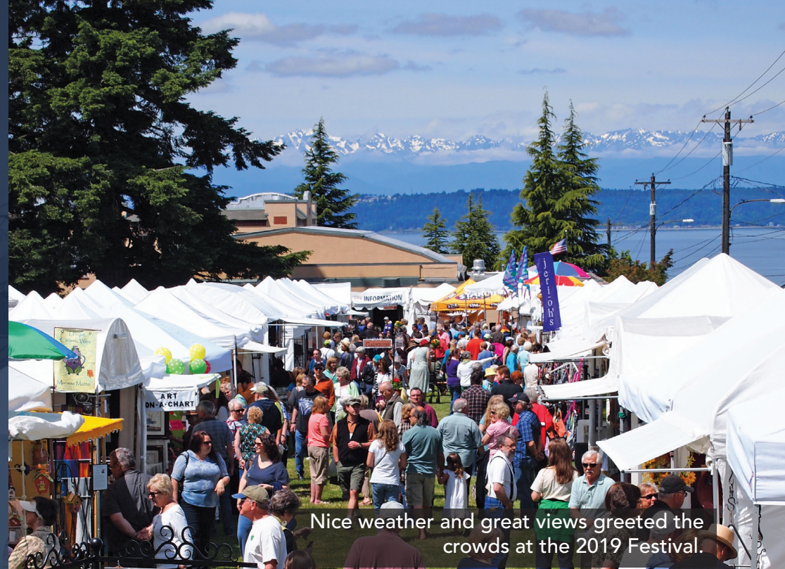
Nice weather and great views greeted the crowds at the 2019 Festival.