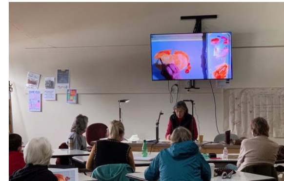
Important technologies were purchased for ArtWorks this year such as this wall mounted monitor used to enhance instruction for a watercolor class.

ArtWorks, funded by the Festival and Foundation, is a unique and welcoming art center in downtown Edmonds offering meeting spaces and on-going art classes for the public including 45 watercolor classes and 65 general classes including photography, calligraphy, drawing, watercolors and mixed media classes as well as jewelry classes. Classes for artists in 2019 included a serial drawing class and Professional Development certified programs. ArtWorks also hosts art shows, exhibits and art sales.