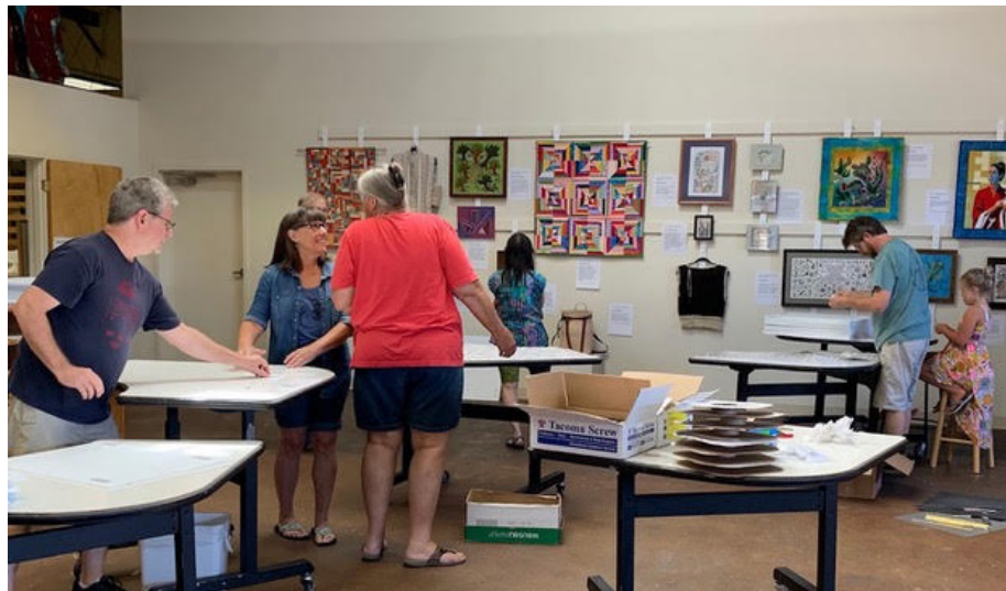
Art Studio Tour members preparing signage for the upcoming Tour.