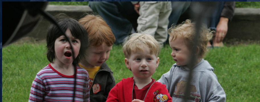
Everyone enjoys the entertainment at the outdoor amphitheater!

The Festival always takes place the third weekend in June, Fathers' Day Weekend, over that Friday, Saturday, and Sunday. The 2019 Festival received rave reviews from attendees who enjoyed the art, food, and entertainment. The weather was perfect for Festival goers, artists went home happy with the Festival and their sales, and the Festival made a significant amount of money that was directed to the Foundation's projects. Doesn't get much better than that!