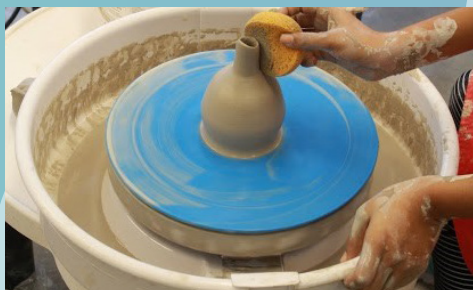
Raku Pottery, Meadowdale High School