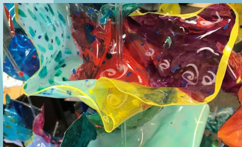
Chihuly Bilagio Project, Beverly Elementary

In 2019, more than $30,000 was awarded to the following institutions: