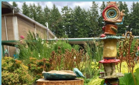
Garden Art Grant, Edmonds K-12

The Foundation congratulates grant recipients for focusing on visual arts and culture that promote student education.