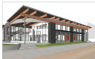
Rendering of new Edmonds Waterfront Center

To learn more about the Edmonds Arts Festival Foundation scholarship and grants programs visit www.eaffoundation.org