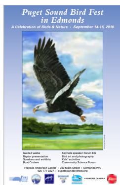
2018 Bird Fest Poster