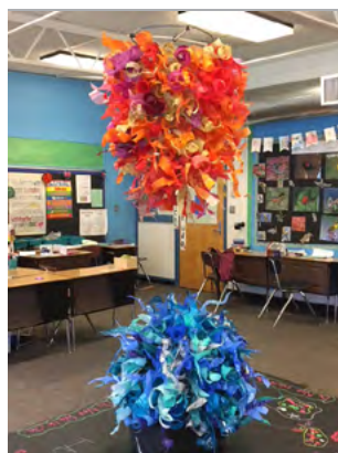
Chihuly's Belagio, Beverly Elementary School

Since 1996, this program has contributed over $330,000 in support of local teachers, providing visual arts education as part of the classroom curriculum. Edmonds Arts Festival Foundation congratulates these educators focusing on visual arts and culture. With the additional support of volunteers, art docents, and local studio artists, these programs are made possible.