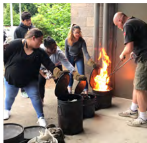
Raku Firing Edmonds Woodway High School

It is fortunate that Edmonds has so many examples of dedicated and creative art teachers who inspire their students every day.