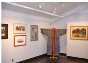
The Foundation Collection