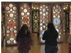
Meadowdale Arts Week, Meadowdale High School