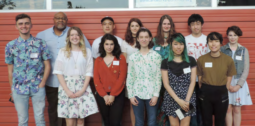
Art Student Scholarship winners