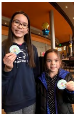
Kidstock, Edmonds Center for the Arts