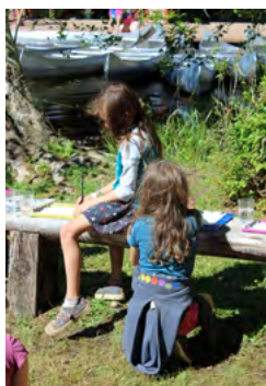
Edmonds School District Girl Scouts explored nature through art at Cedar and Sound Community Camp