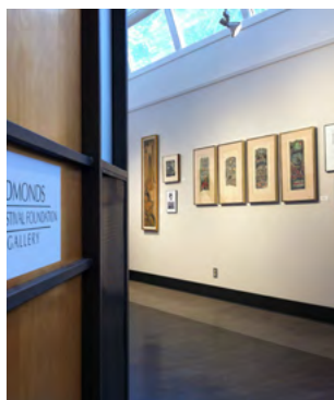
Arts Festival Gallery, Anderson Cultural Center