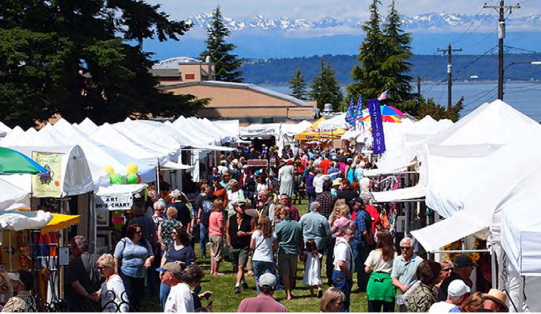
Edmonds Arts Festival