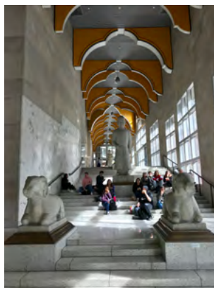
Meadowdale Arts Week, Meadowdale High School