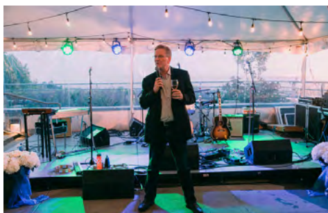
Rick Steves, Art + Cocktails Benefit