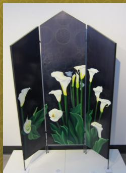
Collaborations, members of Artist Connect