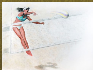
The Spirit of the Human Figure Al Doggett