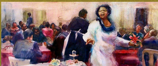
from the EAFF Collection, Lois Silver