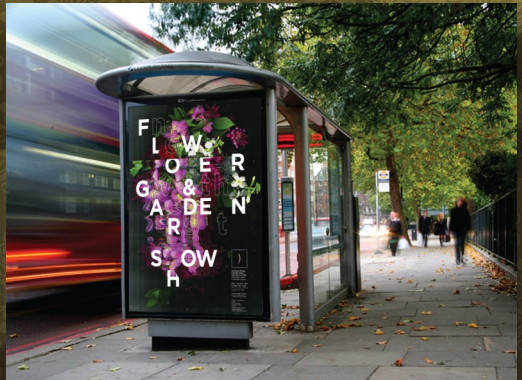
"Flower and Garden Show" by Spencer Shores