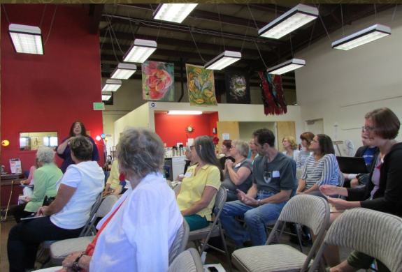
Artists attending an Artists Connect meeting, 2014