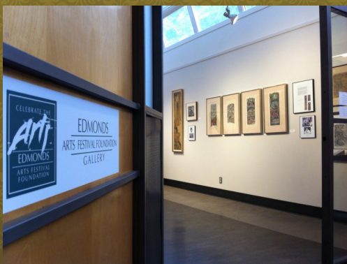
NW School Art: the Edmonds Connection